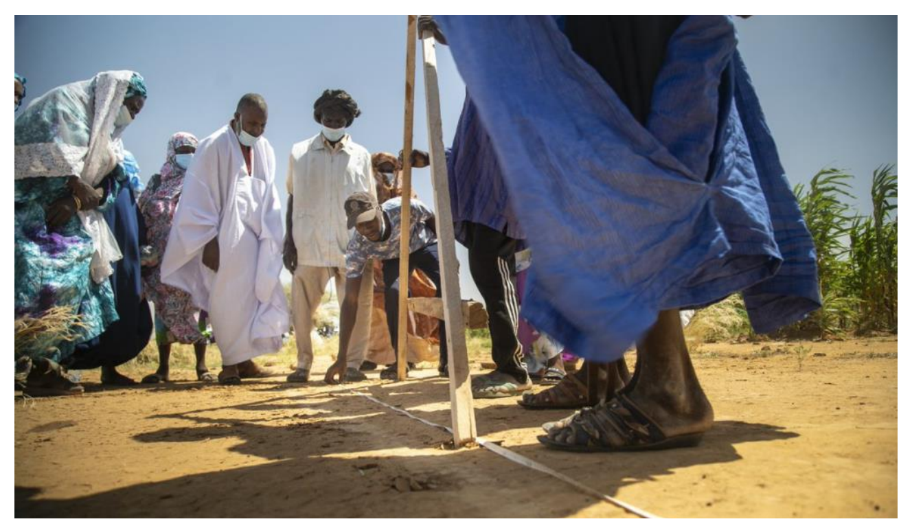
As part of a peer-to-peer training, the communities of the resilience sites in the Mauritanian region of Assaba meet for a day in the village of Goureijma to share good practices. Participants learn how to build half-moons, a traditional agricultural technique used to reduce water runoff and retain scarce rainfall.